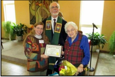
Roz Wealth ~ 40 Years